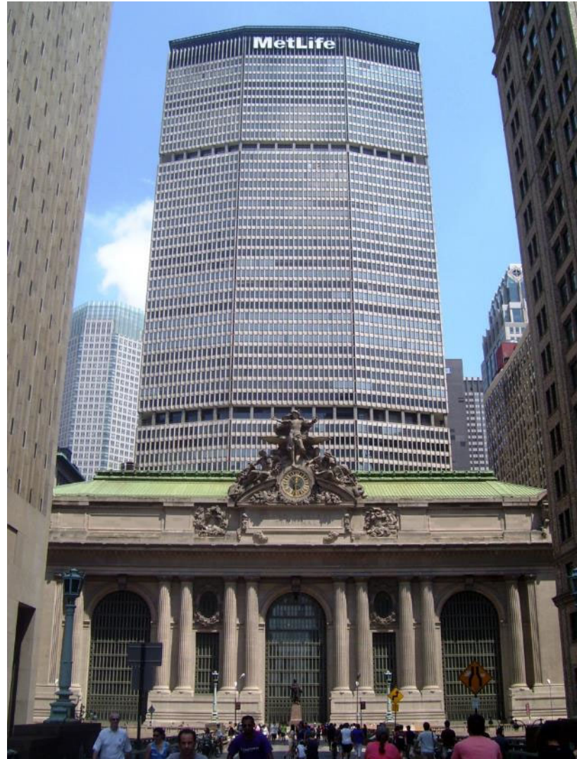
Grand Central Terminal, NYC